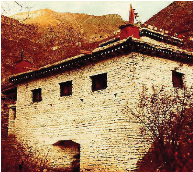
The "Temple Of Miraculous Fire" at Muktinath, Nepal. Photo by Ken Street (Nov. 1979).

[For more on this subject, please read our tract The Temple Of Miraculous Fire .]